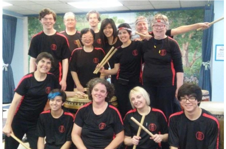
Photo: Kenshin Taiko group performs at Chapman Library.