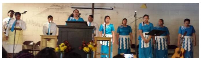
Nichigo, Kachin and Tongan choirs perform during worship service.