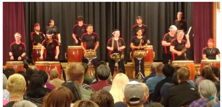
Kenshin Taiko performs before a standing room only crowd.

Bento box dinners were co-sponsored by the Salt Lake Buddhist Temple and JCC as a fundraiser. Thank you to everyone who supported this fundraiser and to those who helped as volunteers in the kitchen, cooking, grilling, and selling tickets. We appreciate all of your help and for giving time to serve the church.