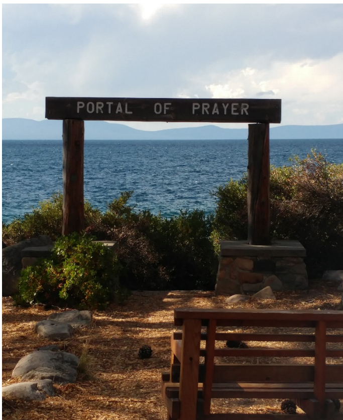
Portal of Prayer, Lake Tahoe.