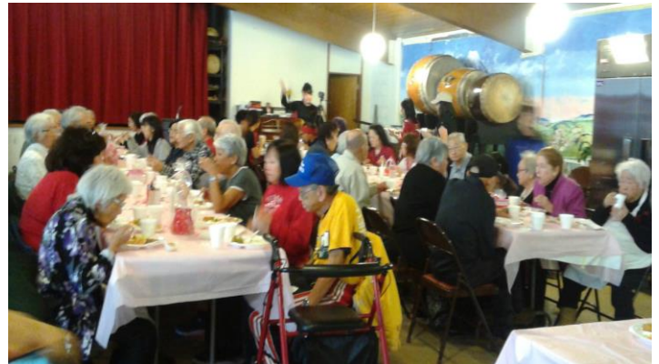
A full house enjoys the Nikkei Senior Center luncheon.

Thanks to everyone who attended, but especially to those that gave up their Saturday to help set up, prepare, plate and serve food. This luncheon is well attended annually and opens our church to the JA community.