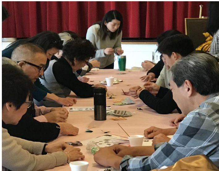
Intense folding.