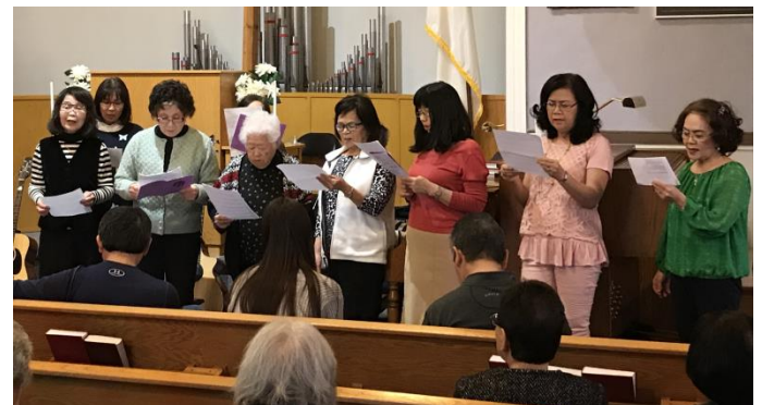
Nichigo Choir, March 23