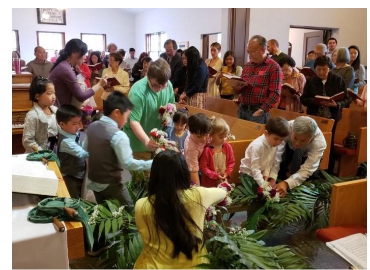
In front of a full chapel, the Sunday School children place flowers on the cross as the congregation sings Alleluia!