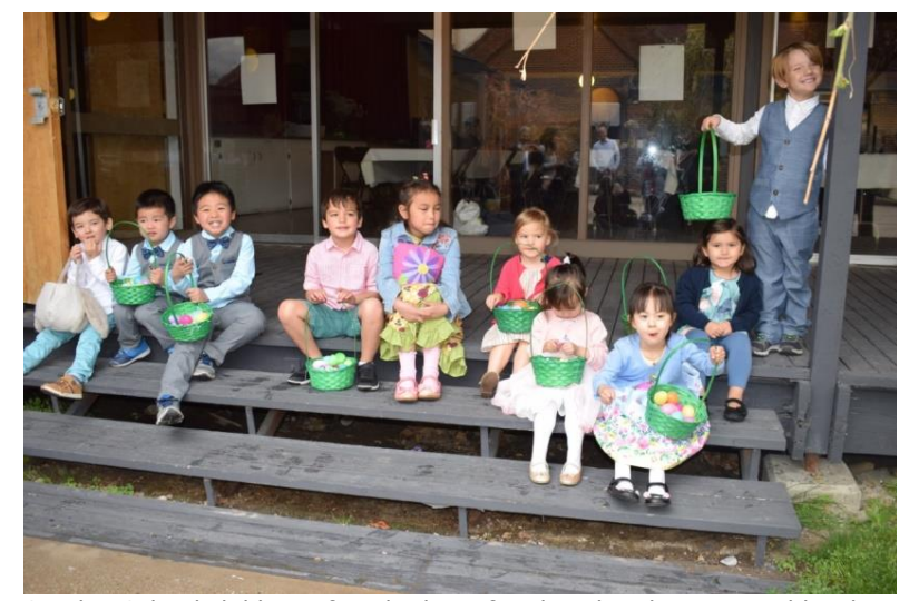
Sunday School children after the hunt for chocolate bunnies and hard boiled eggs.