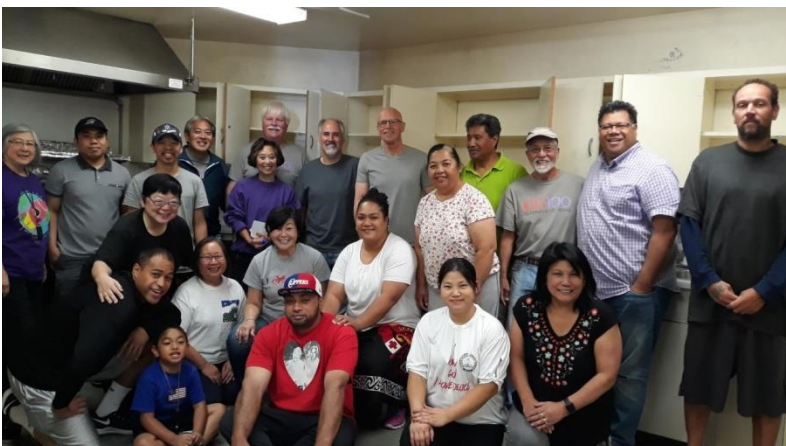
Members of the JCC, Kachin and Tongan congregations joined together to pack up the Fellowship Hall kitchen.