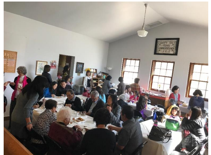
Coffee Fellowship in close quarters.

We are adjusting and working through temporary changes during the Fellowship Hall remodel. The Nichigo group is holding bible study in the pastor’s office and Sunday School is being held on the stage in the Fellowship Hall for the time being. Coffee Fellowship continues right after worship service in the Issei lounge area of the chapel. Quarters are tight, but everyone still enjoys the weekly sermons and fellowship with friends. Please join us and see the progress of the Fellowship Hall construction!