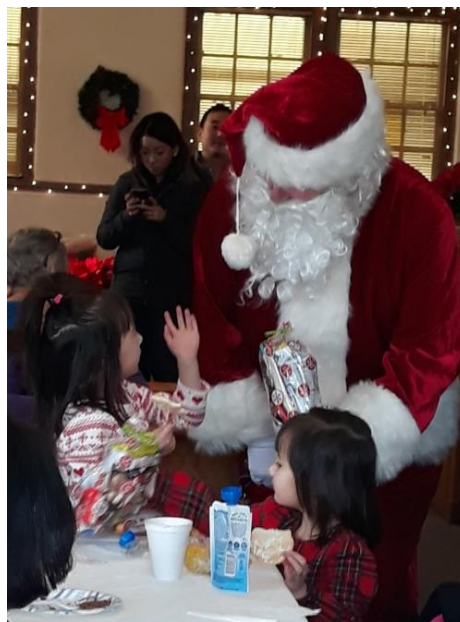
Santa made his annual visit to JCC.