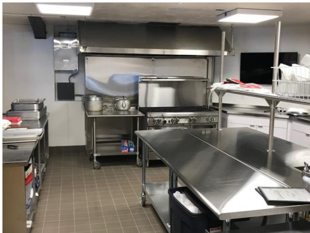
New flooring, stove, and stainless steel all around.