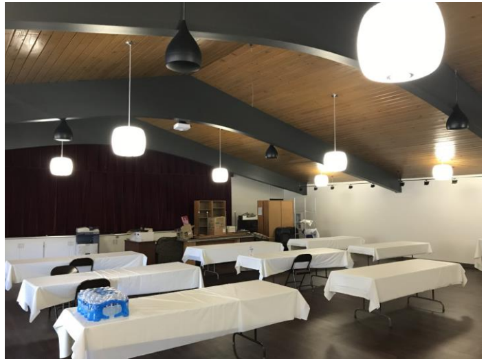
New flooring, stage curtains, track lighting along the wall and Asian inspired lights in the main hall area.