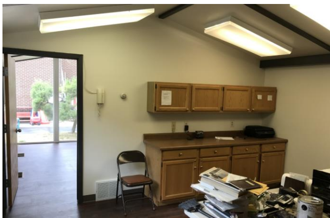
Business office and entry to Pastor's office.