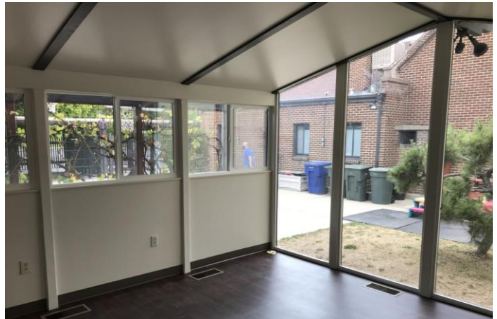
Pastor Brad's office, redone after extensive water damage and mold were discovered.