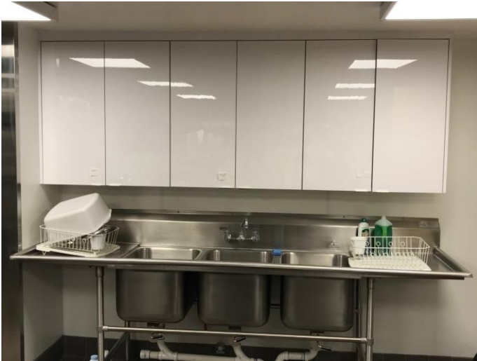
New 3 compartment kitchen sink and shiny new cabinets. All photos courtesy Greg Paige.

Here are some photos of our "new" Fellowship Hall. A stainless steel kitchen with new equipment; Fellowship Hall with new flooring, lighting and curtains; 2 new accessible restrooms on the main floor - all waiting for our return to the JCC!