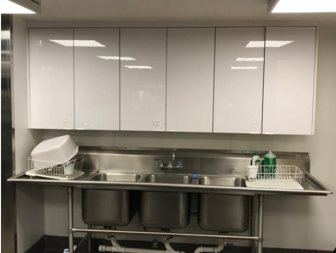
New 3 compartment kitchen sink and shiny new cabinets.

Here are some photos of our "new" Fellowship Hall. A stainless steel kitchen with new equipment; Fellowship Hall with new flooring, lighting and curtains; 2 new accessible restrooms on the main floor - all waiting for our return to the JCC!