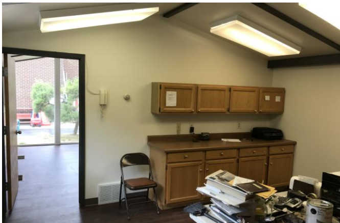
Business office and entry to Pastor's office.