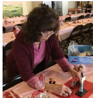
Above: Nikkei Senior Center luncheon attendees enjoy food and a performance by Kenshin Taiko.