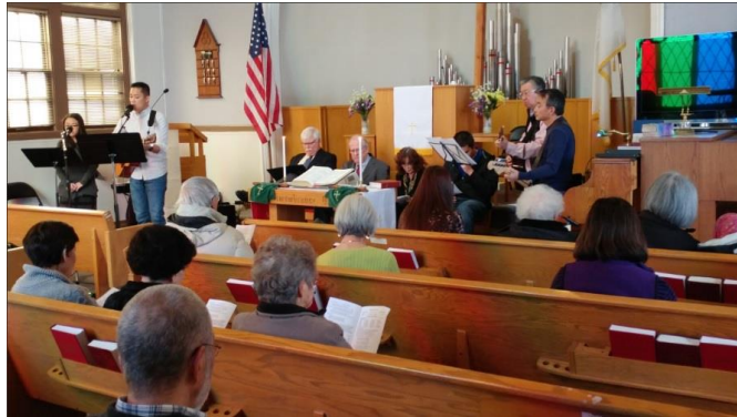
JCC Worship Band at February 26 service.