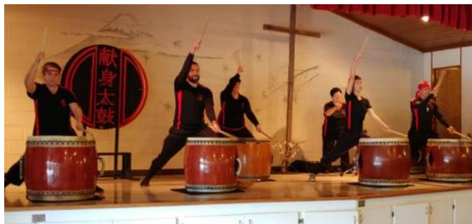
Kenshin Taiko performs at Nikkei Senior Center luncheon in February.