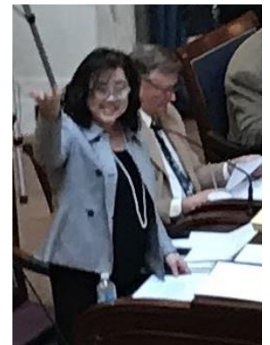
Jani Iwamoto waves to supporters in balcony.

On February 10, Utah State Senator Jani Iwamoto sponsored a resolution to urge the U.S. Postmaster General to issue a commemorative postage stamp honoring Japanese American veterans of World War II. The resolution received support from the legislature and Governor Herbert. Many members of the JA community made the trip to the Capitol to support the resolution.