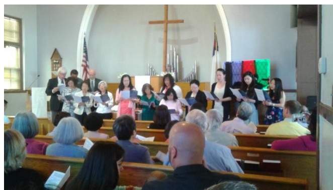
The JCC choir performs during Easter worship service.