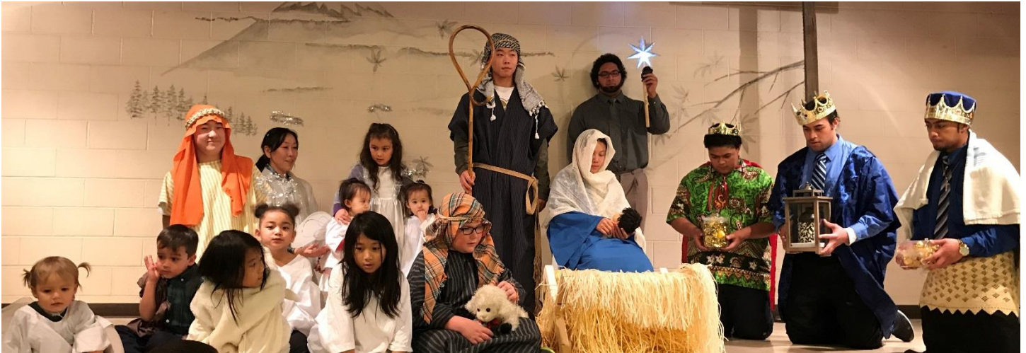
The Nativity Scene with JCC, Tongan and Kachin congregations.