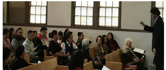
The Tongan choir performs during Palm Sunday service.