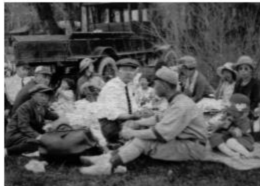
1925 Members loved picnics, getting there in a Model T truck