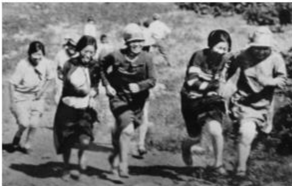
1924 Ladies participate in races at church picnics