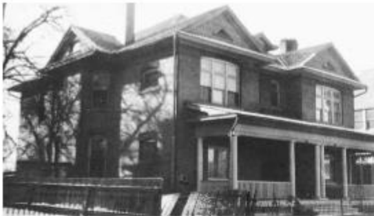
1925 The church purchased the manse duplex across the street, a parsonage and dormitory for students.

Here is a sample page from the first section of the book: