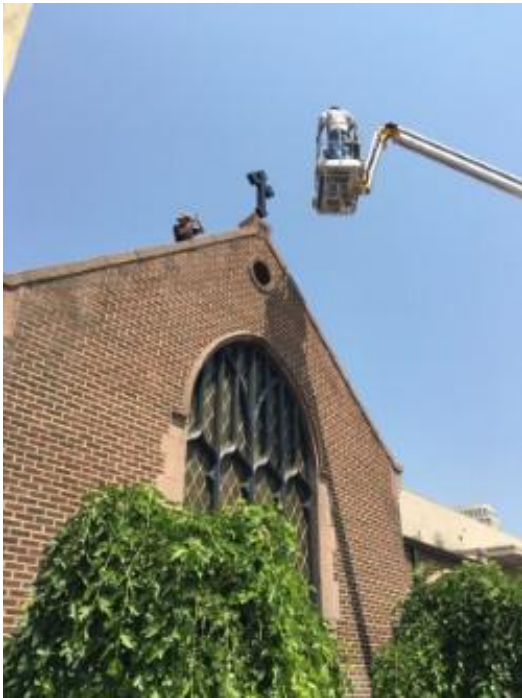
A cross now graces the JCC chapel

A cross was in the original plans for the chapel, but was never installed. It has taken this many years, but finally the JCC chapel has a cross that symbolizes faith and healing.