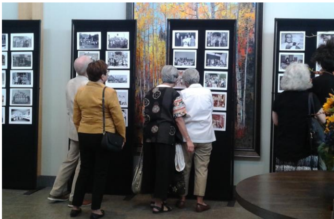
Guests view photo displays at Cottonwood Country Club luncheon.

Unfortunately, this celebration ended on the same day as the Herald deadline – look for photos of the events in the October Herald and website as well as posted on the bulletin boards in the Fellowship Hall in the days to come.