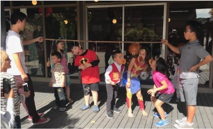
Bobbing for donuts!