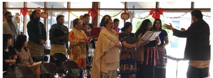
Tongan choir performs.

A joint worship service and luncheon with the Tongan and Kachin congregations was held on Sunday, October 28. It is always nice to join together in worship and music. Praise the lord!