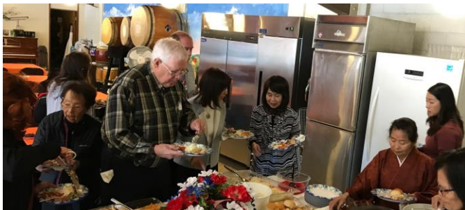
As always, there was plenty of food!