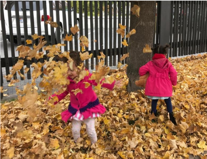
Playing in the leaves!