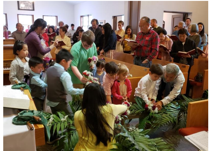
In front of a full chapel, the Sunday School children place flowers on the cross as the congregation sings Alleluia!