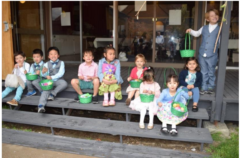
Sunday School children after the hunt for chocolate bunnies and hard boiled eggs.