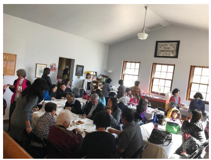
Coffee Fellowship in close quarters.

We are adjusting and working through temporary changes during the Fellowship Hall remodel. The Nichigo group is holding bible study in the pastor's office and Sunday School is being held on the stage in the Fellowship Hall for the time being. Coffee Fellowship continues right after worship service in the Issei lounge area of the chapel. Quarters are tight, but everyone still enjoys the weekly sermons and fellowship with friends. Please join us and see the progress of the Fellowship Hall construction!