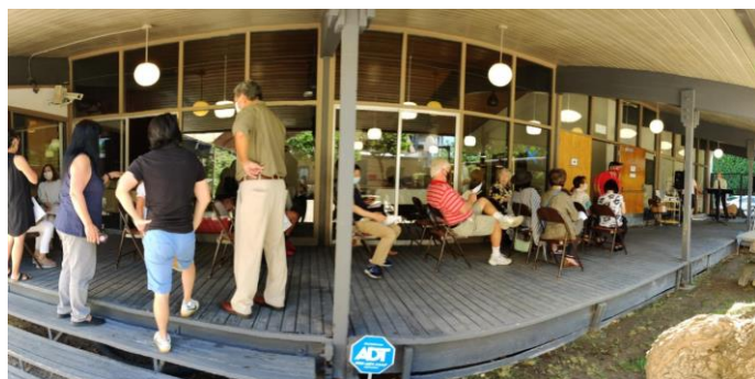
A fish-eye view of Father's Day services.