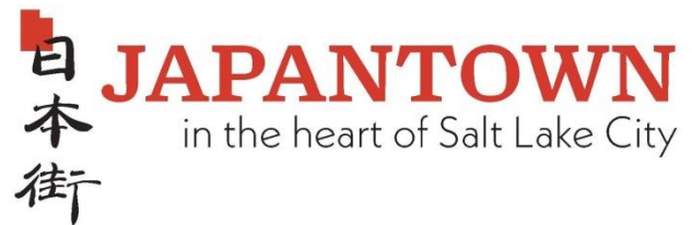
JCC May 2022 Calendar

Hours at the museum are Thursdays, Fridays and Saturdays, from 10:00 a.m. to 4:00 p.m. and admission is free. The museum is located in the middle of Liberty Park. To visit, enter the park from either 900 or 1300 South and follow signs to the parking lots near the center of the park. From each parking lot, there are sidewalks leading to the museum.