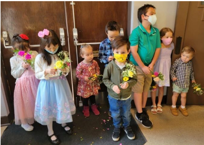
Children await their turn to decorate the floral cross.