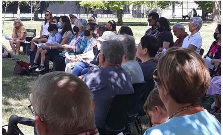
Worship service under the shade at Liberty Park.