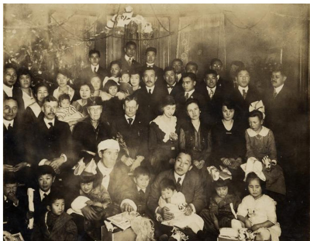
Left: A photo from the 75 th Anniversary book – JCC Christmas Party in December 1918.