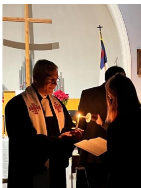
Lighting the candles on a wondrous night.