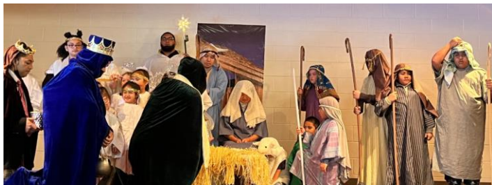
Arrival of the Wise Men while shepherds look on.