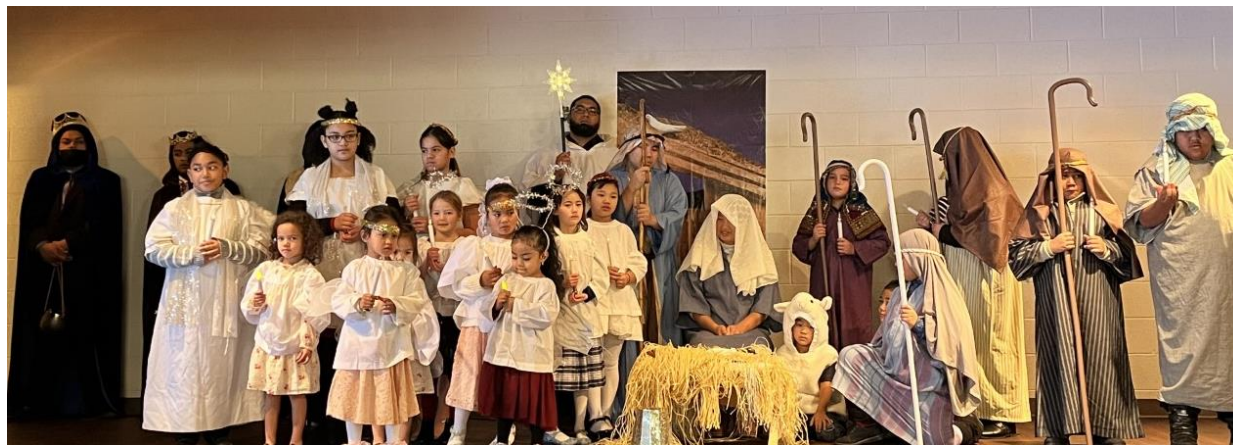
Below: The cast from three congregations participating in the Christmas story in December 2022.