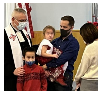
Flemming family and Pastor Haas