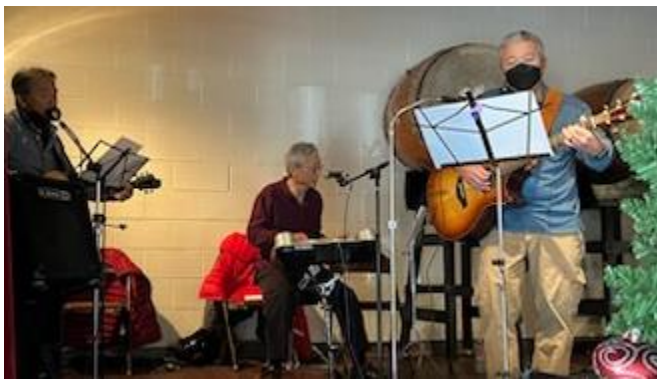
JCC Worship Band performs - December 11.