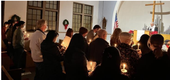
Christmas Eve attendees sing.