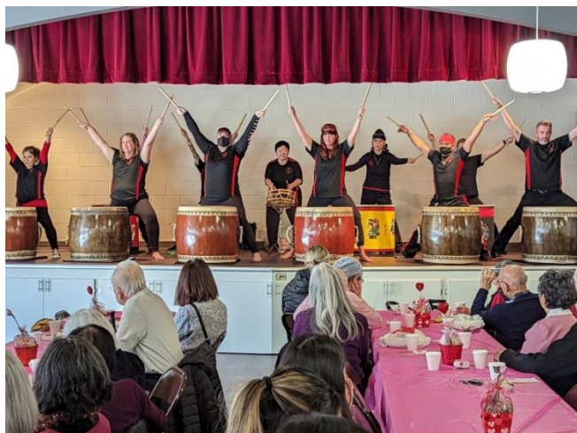
Kenshin Taiko performs at February Nikkei Senior Luncheon