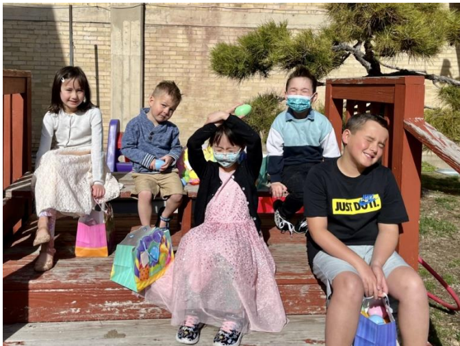
The sunny day was a little too bright for the Easter egg hunters!