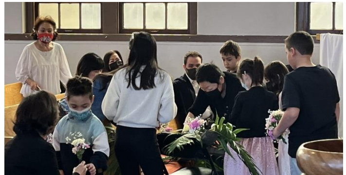
Children adorn the cross with flowers on Easter.