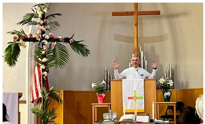
A joyous Easter sermon.