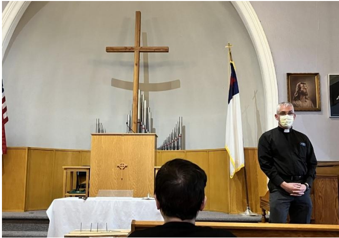
The pulpit is stripped on Good Friday.