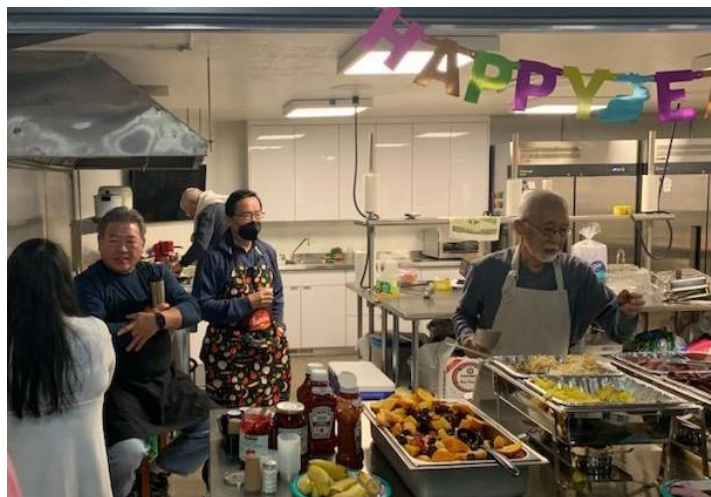
Cooking in the kitchen; plenty of food!