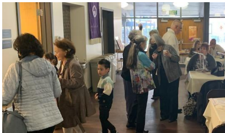
Easter breakfast buffet