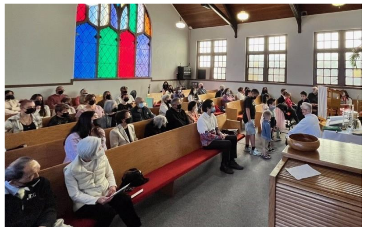
Easter Sunday children's sermonette.