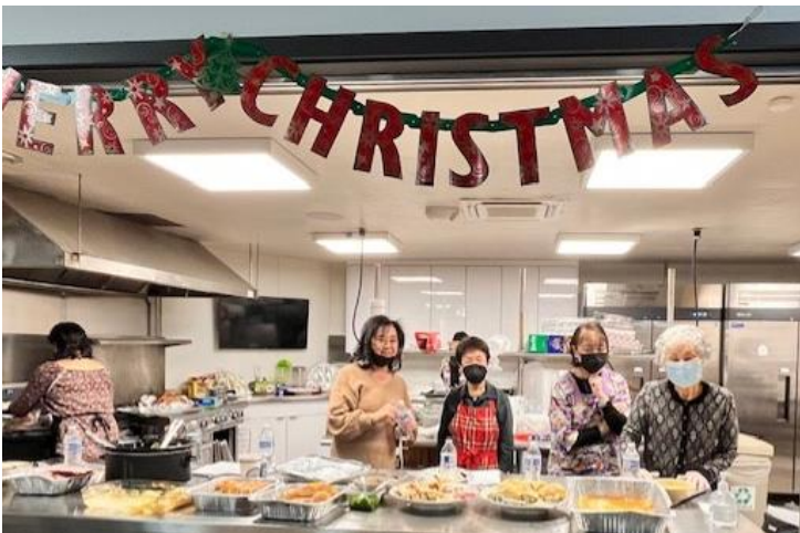
Kitchen servers ready to plate!