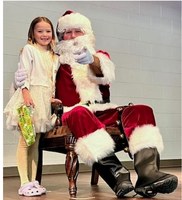
Smile for the camera!