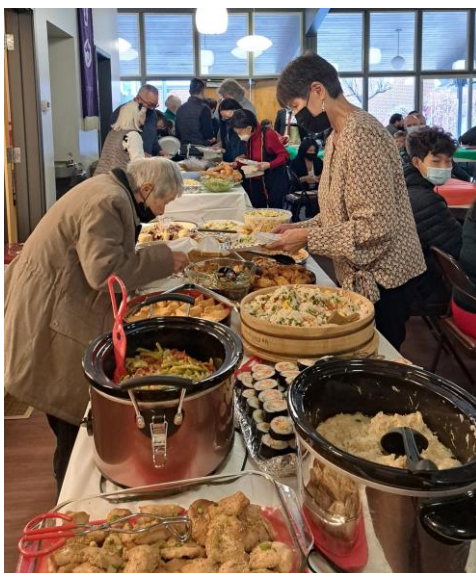
Food was plentiful