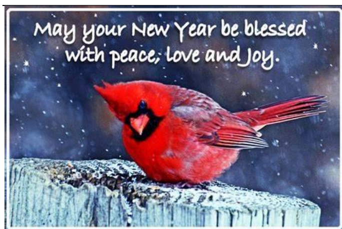
JCC January 2024 Calendar

The Mission Study committee was asked by the Committee on Ministry to give some additional information on how the data was collected for the study. A revision was provided and reviewed by the Session which was approved on 12/12/23. The revised mission study will be submitted to the Committee on Ministry for final review. Should there be no further review, then the final version will be presented to the congregation at the Congregational Meeting.