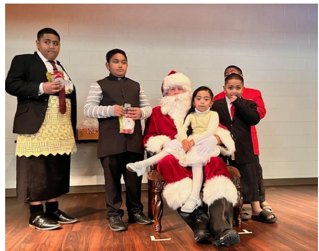
Santa is popular!