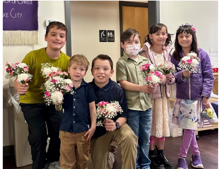
Getting ready to decorate the cross