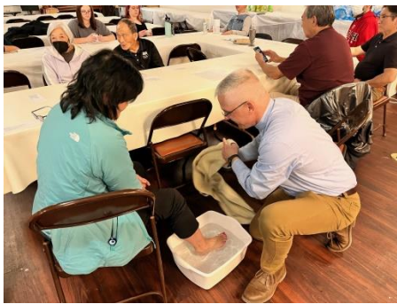
I'm glad I got that pedicure this morning!

On Maundy Thursday, worshippers took part in washing of the feet and re-enacting DaVinci's "The Last Supper."