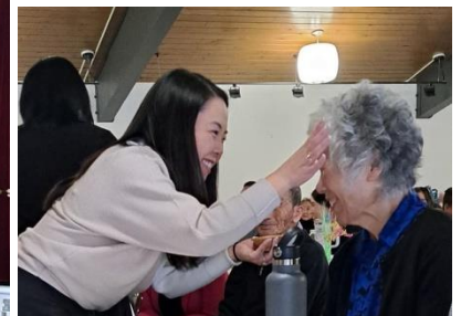
Anointed with oil