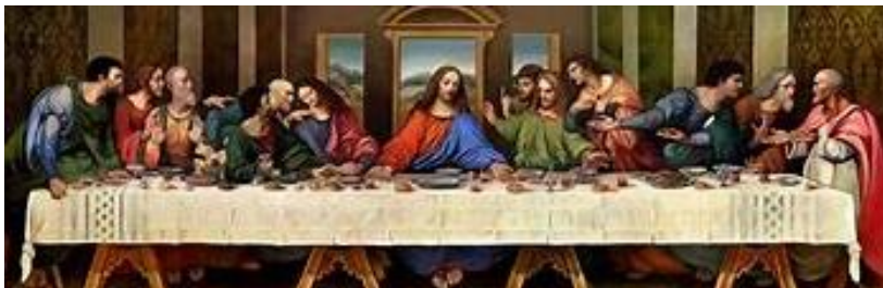
DaVinci's "The Last Supper"