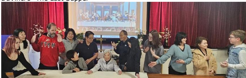
JCC's "The Last Supper"