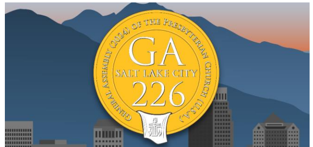
JCC April 2024 Calendar

On the Road to GA226 - Issue 8 - March 2024 by PCUSA OGA - Issuu