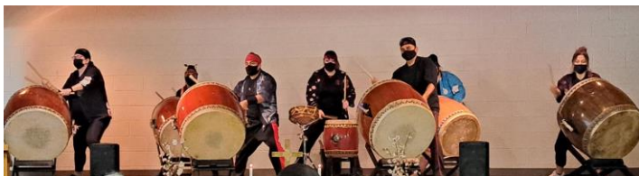
Kenshin Taiko performs at worship service.

May is Pacific Islander and Asian American Ministries (PAAM) month. On Sunday, April 28, 2024, Kenshin Taiko performed during worship service to kick off the month.