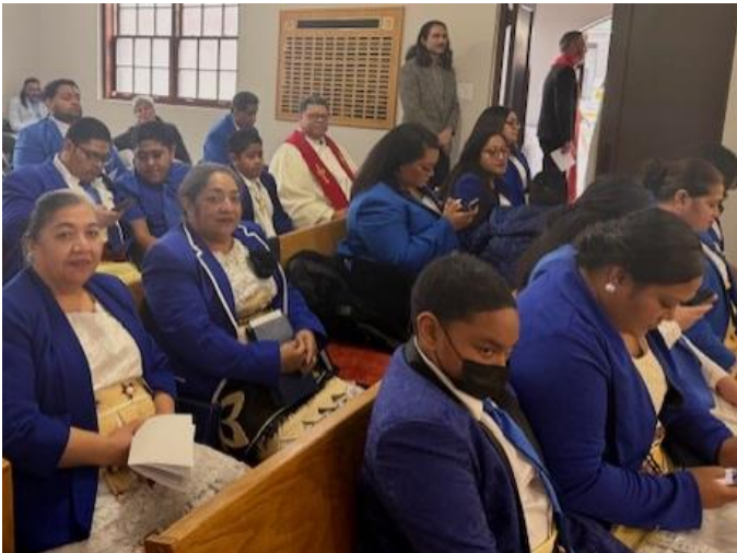
Anchored in Christ choir