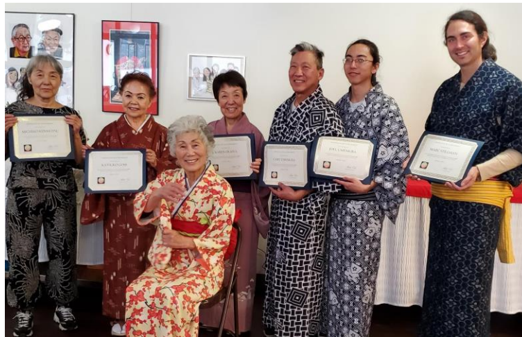
Nerikiri graduate students and sensei