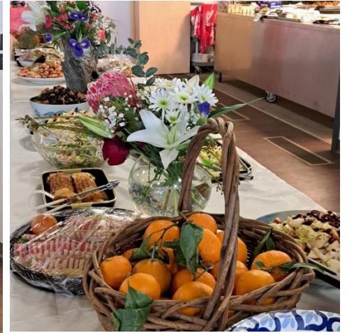
A feast for the New Year!